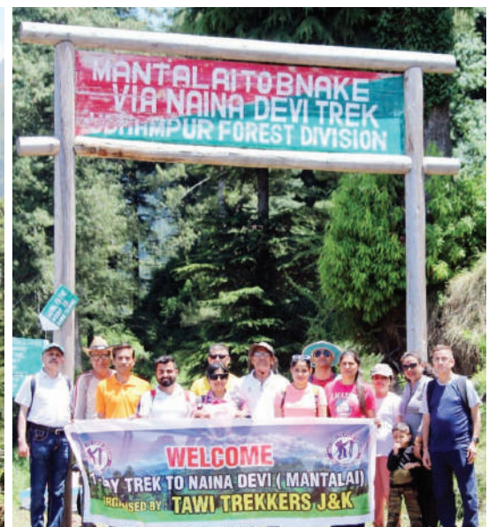
Trekkers outside Naina Devi temple in Mantalai in district Udhampur.

haustive reconnaissance being carried out by the club to explore the possibilities of making Jammu region an all weather hub of soft adventure activities like adventure camps/ picnics and short heritage treks.