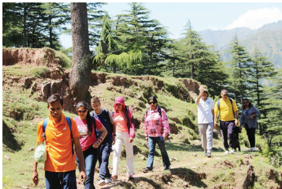
Trekkers on the go in Mantalai area of district Udhampur.

Starting the five kilometers trek from Mantalai, about 55 kms from Udhampur, the trekkers enjoyed beautiful panoramic views of the sacred Sudhmahadev and Mantalai areas while ascending the bridge trail. The trekkers were awestruck by the beauty of nature when they suddenly entered a dense and dark forest which con-