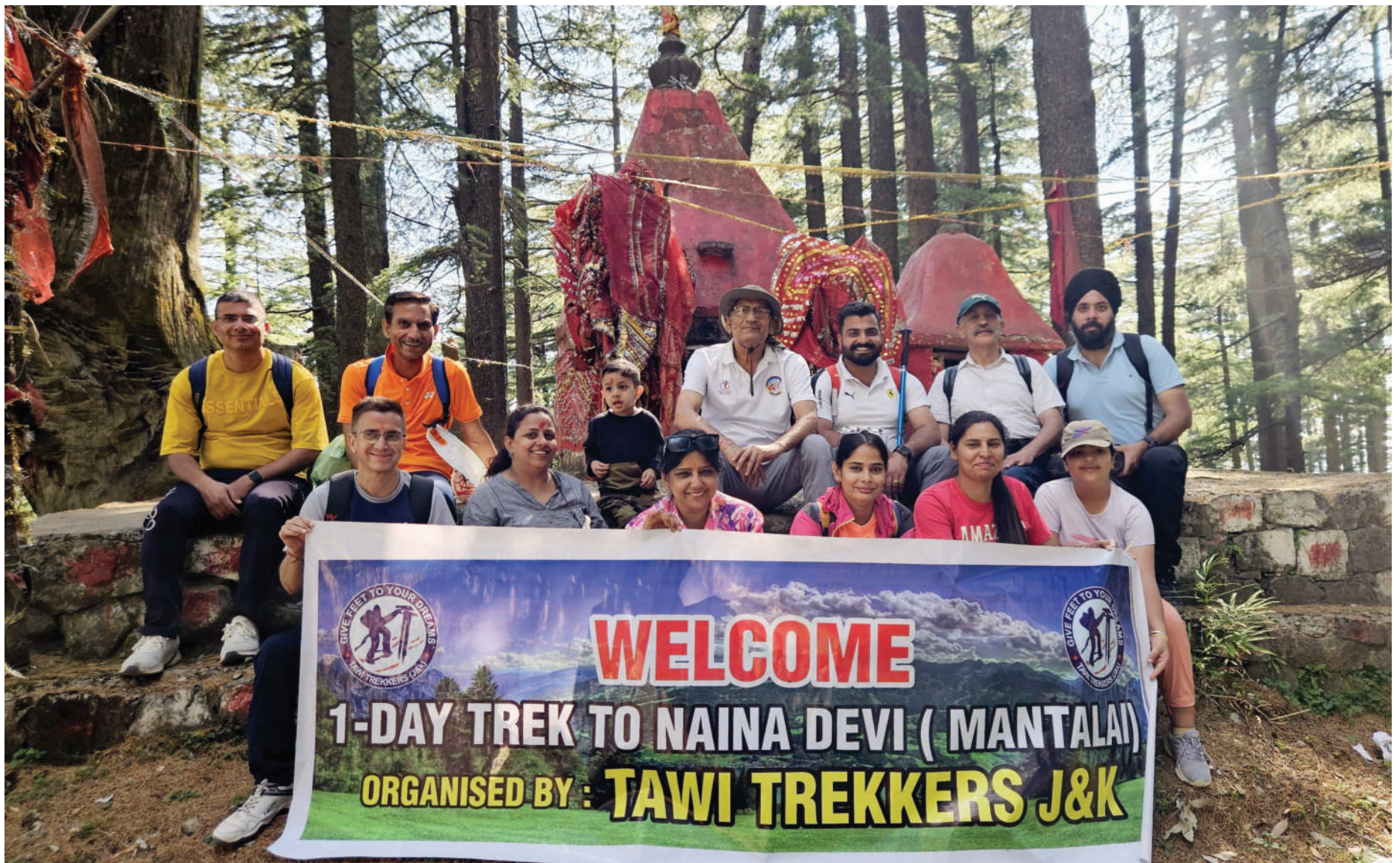
Participants at the start of their trek to Naina Devi in Mantalai of district Udhampur.